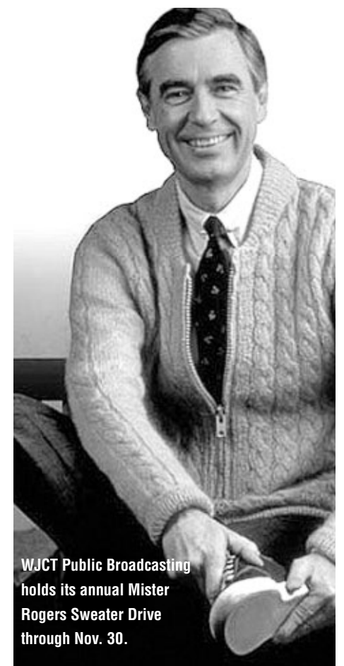
WJCT Public Broadcasting holds its annual Mister Rogers Sweater Drive through Nov. 30.

P.O. Box 119, Orange Park, 215-3150 This volunteer-based group collects and provides food to organizations serving the homeless and hungry, low-income families and seniors, people with disabilities and at-risk youths. Monetary donations and volunteers are needed.