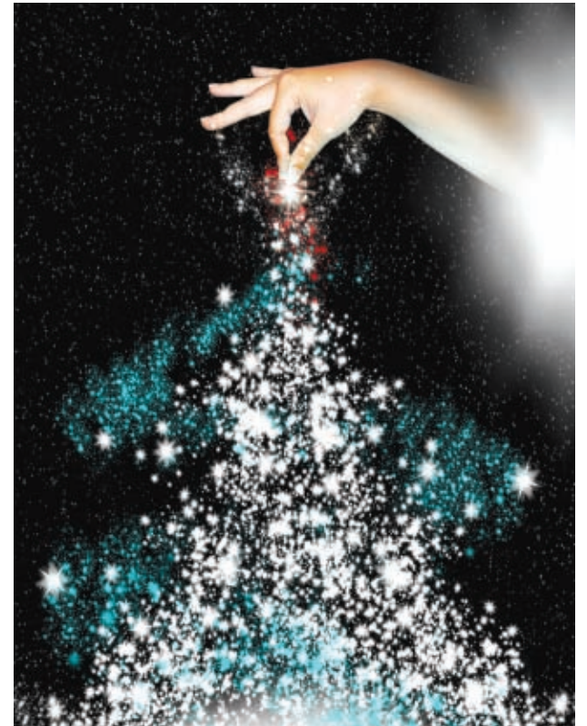
The official Fernandina Beach Christmas Tree Lighting Ceremony kicks off the season on Saturday, Nov. 27.

Civil War re-enactors portray the holiday season as it would have been in 1864, by decorating their station for a UNION HOLIDAY ENCAMPMENT from 9 a.m.-5 p.m. at Fort Clinch State Park, 2601 Atlantic Ave.,