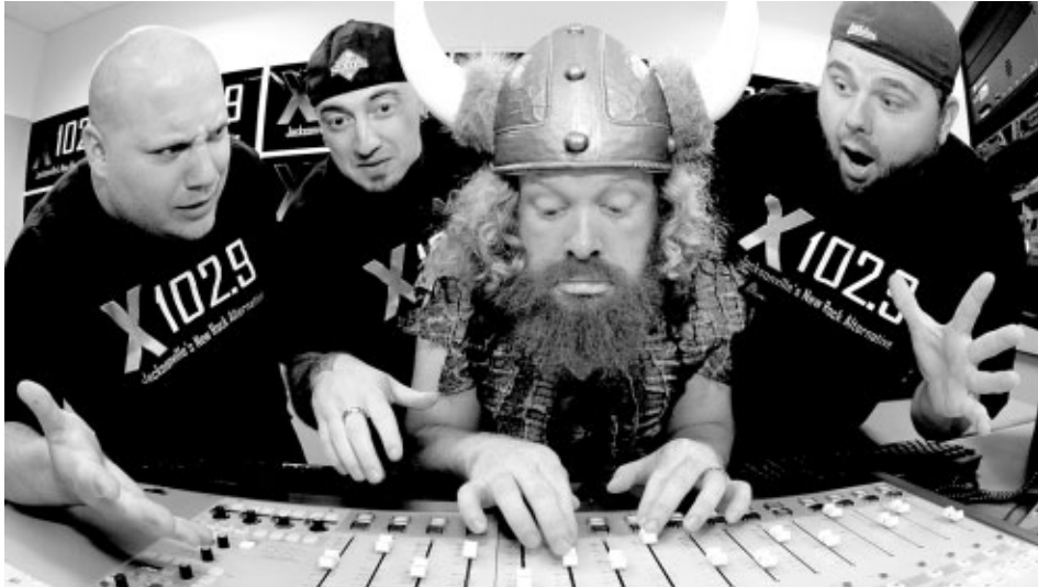
Best Local Radio Station: X 102.9 FM

an Emmy Award-winning journalist, the Albuquerque, N.M. native enjoys Frank Sinatra, Michael Bublé and long walks on the beach (OK, we made that last part up).