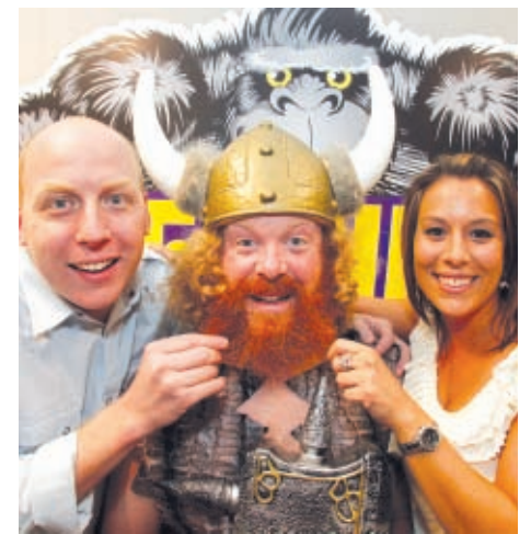
Best Local Radio Show: WAPE's "Morning Mess"

Since 1957, First Coast News has covered news, traffic and weather for Northeast Florida and Southeast Georgia. It was the first television station to air a live launch from Cape Canaveral in the '60s and helped establish community-supported WJCT. Once the unlikely upstart in a market dominated by Channel 4, the First Coast News posse has amassed a