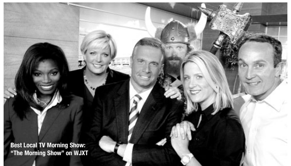
Best Local TV Morning Show: "The Morning Show" on WJXT

The bloggers of Metro Jacksonville are a tenacious bunch. They claim a subject, then report on it, link to other media stories about it,